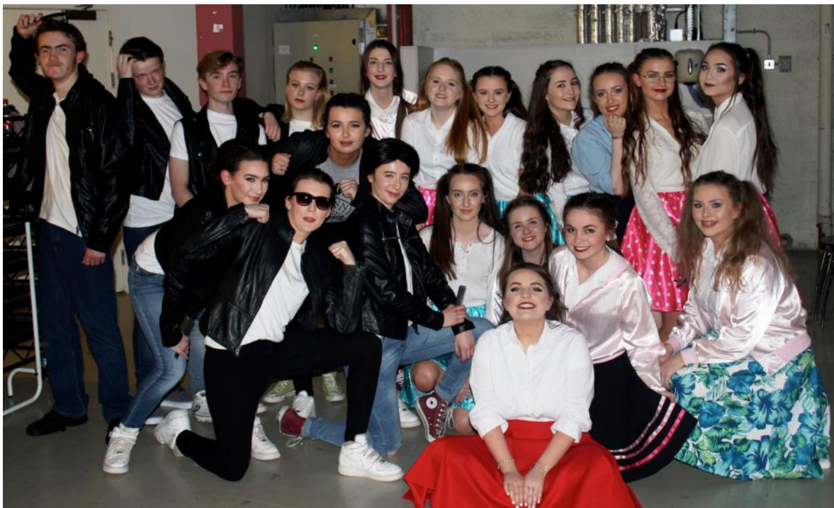
Transition Year Drama, Summer Lovin' from Grease